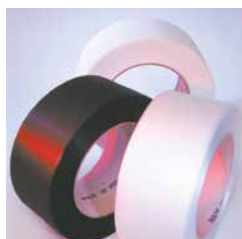
Strap for cost effective strapping Use of thin PP strap