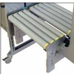
Options Adaptable to different operating conditions and requirements