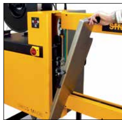
Easily accessible, maintenance without tools