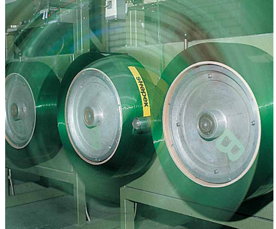
Quality Quality strap, delivered carefully wound, well bound and in cartons