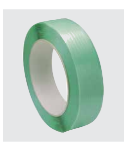
High tensile strap Polyester PET