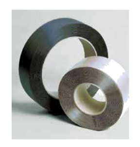
Strap Polypropylene PP