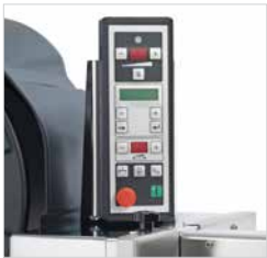
Simple adjustments, pivotal control panel