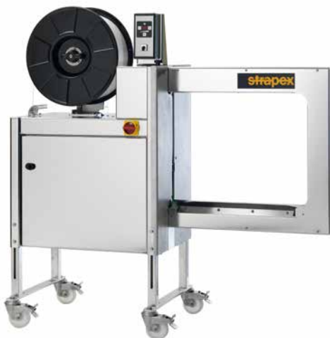
SMG 65i / SMG 65iS