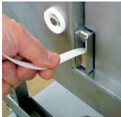
Quick coil change, automatic strap threading