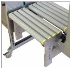
Various options Adaptable to different operating conditions and requirements

Machine, strap and after-sales service as a total package